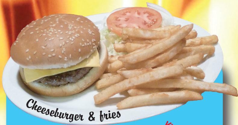
Cheeseburger & fries