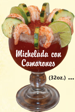
Michelada con Camarones