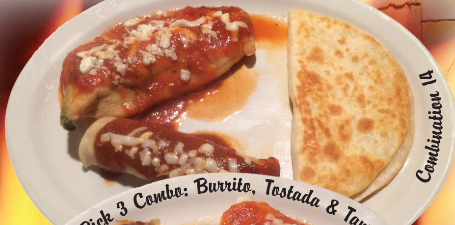
Pick 3 Combo: Burrito, Tostada & Tamale